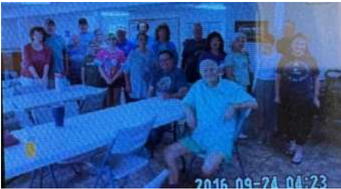
Picture 3 - Separating the food in the Parish Hall.

The Second Tuesday of the month came around again on August the 12 th . Twenty-three individuals/families received a big bag of food; however, the process for issuing the food was very different this month. Instead of the people remaining in their cars on the side of the Parish Hall and receiving their food in their cars, Catholic Charities changed their rules, and all the cars had to drive through the church parking area and line up in front of the ramp to the Parish Hall one behind the other, get out of their cars come into the Parish Hall sign a document, receive their food, and drive on. Some of the older drivers were afraid to drive through the underpass to the hall. It was not a good operation. The Care Center director will see what she can do to get back to the old and very safe procedure where people remain in the parking area and receive food in their cars.